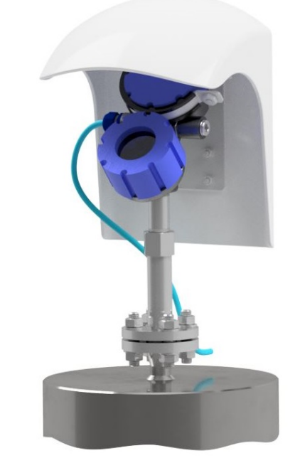
Application example: SD 18 mounted on transmitter by means of INTERTEC bracket