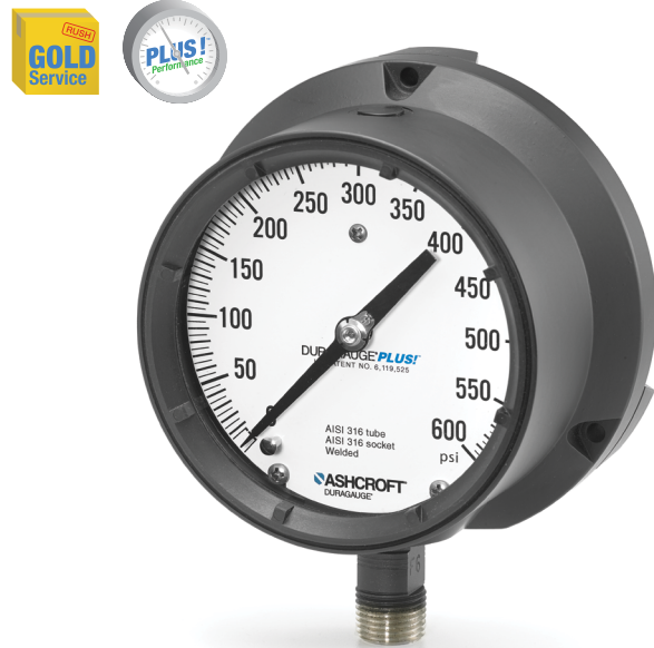
1379 4½", 6", 8½" dial size