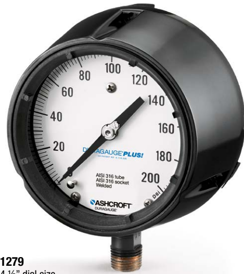
1279 4 1/2" dial size